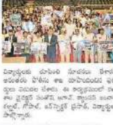
విద్యార్థులకు డ్రగ్స్ కు దూరంగా ఉంటేనే ఉజ్జ్వల భవిష్యత్తు ఉంటుంది. డ్రగ్స్ కు దూరంగా ఉంటేనే ఉజ్జ్వల భవిష్యత్తు ఉంటుంది.

● వాల్మీకి జ్యూరీ సామైలైజ్ చేసి కుటుంబం ద్వారా వచ్చే విద్యార్థులకు మాజీ ప్రధాన మంత్రిగారు కంటి కెమెంట్ చేశారు. డ్రగ్స్ కు దూరంగా ఉంటేనే ఉజ్జ్వల భవిష్యత్తు ఉంటుంది. డ్రగ్స్ కు దూరంగా ఉంటేనే ఉజ్జ్వల భవిష్యత్తు ఉంటుంది.