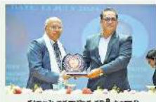
చట్టం అమలు చేసే అంశం. నమస్తే తెలంగాణ. చట్టం అమలు చేసే అంశం.