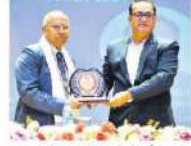
విద్యార్థులకు సాక్షి లక్ష్యం దిశగా ముందుకు సాగాలి. విద్యార్థులకు సాక్షి లక్ష్యం దిశగా ముందుకు సాగాలి.

● విద్యార్థులకు సాక్షి లక్ష్యం దిశగా ముందుకు సాగాలి. విద్యార్థులకు సాక్షి లక్ష్యం దిశగా ముందుకు సాగాలి.