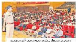
సీనియర్ మాస్టరులును సామైలైజ్ చేసి మొదలైన కార్యక్రమంలో గుం సింగియా-సిని యూనివర్సిటీలో జరిగిన విద్యార్థులకు మాజీ ప్రధాన మంత్రిగారు, వారి వ్యవసాసాలపై అవగాహన సేయించే నిరంతరం ప్రయత్నం చేశారు.

శంషేగాబద్ లో యువక డ్రగ్స్ కు దూరంగా ఉండాలి అంటూ డిఎంపీ జ్యూరీ సభ్యులు సూచనలు చేశారు.