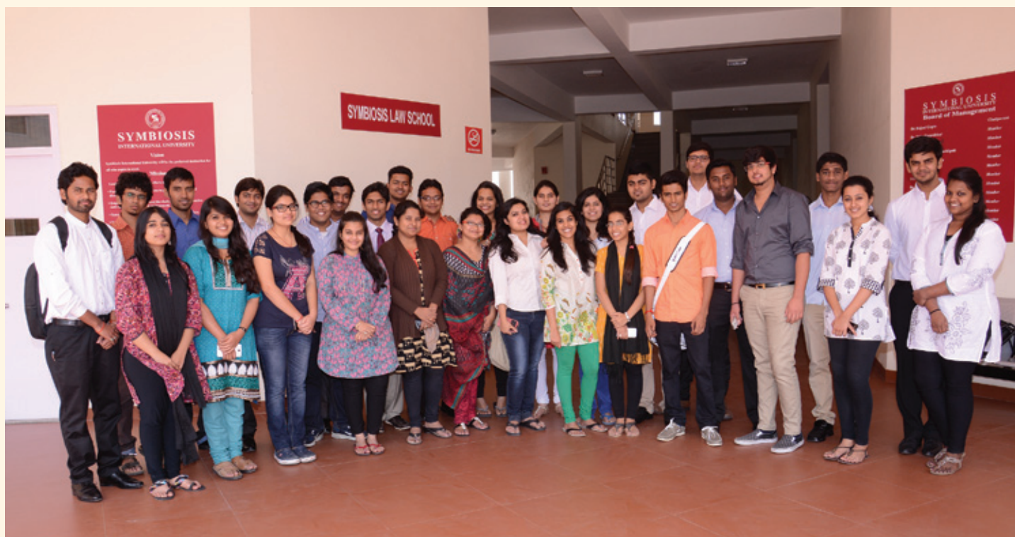
First batch of BBA LLB and BA LLB at Symbiosis Law School, Hyderabad

Also, given the diverse cultural backgrounds of the students, SLS Hyderabad campus encourages them to celebrate all the festivals of India reflecting the slogan of Symbiosis, " VasudaivaKutumbakam "