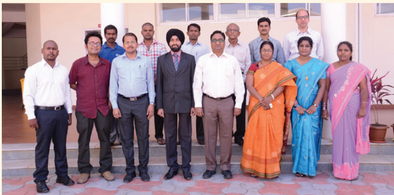
Director, Deputy Director and the faculty team of SLS, Hyderabad