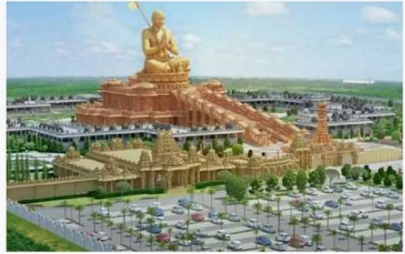
Statue of Equality