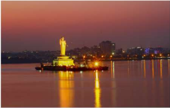
Hussain Sagar Lake