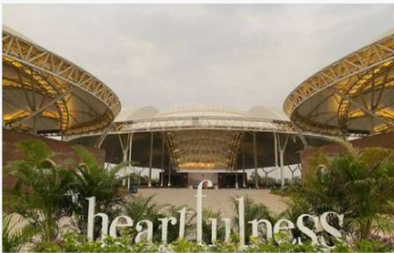
Kanha Shanti Vanam