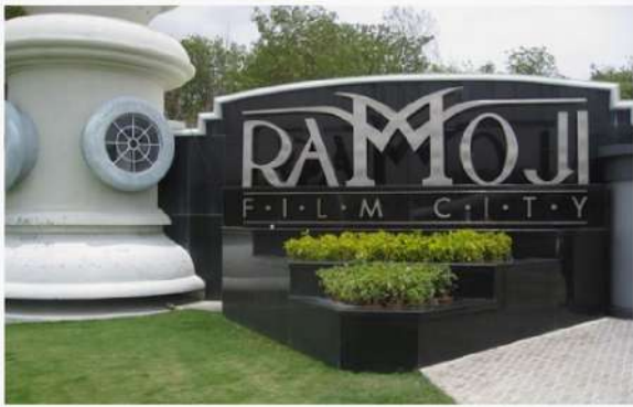
Ramoji Film City