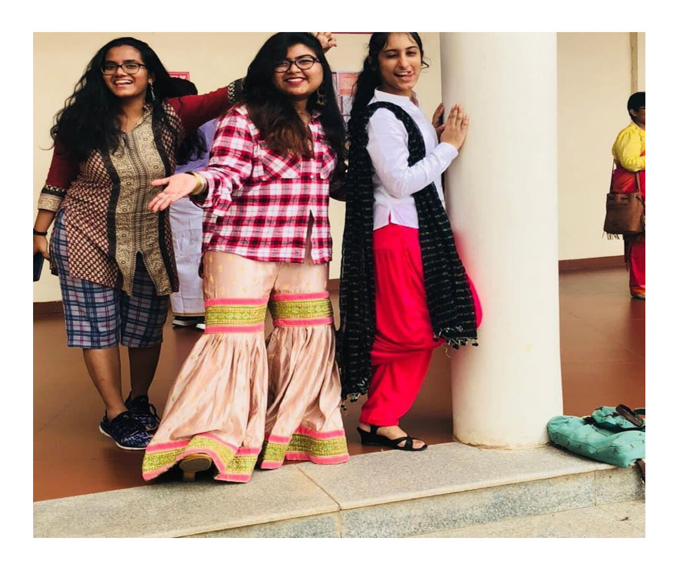
Ethnic Day Celebration by Cultural Cell

Cultural Cell organized a three days celebration for the Ethnic Day during 24<sup>th</sup>- 26<sup>th</sup> September 2018. Each of these three days was celebrated with a theme. The theme for 24<sup>th</sup> September 2018, the first day of the Ethnic day was "mismatch". In the evening a fashion show and movie ( Zindagi Na Milegi Dubara ) was organized by the cell. Day two of the Ethnic Day had the theme of twining, where in two people was to wear similar cloths. Last day of the Ethnic day was where each class was given a theme to decorate their class rooms and were being judged by the faculties. Evening there was a dance competition where prizes were given to the best team, which was followed by a candle light dinner.