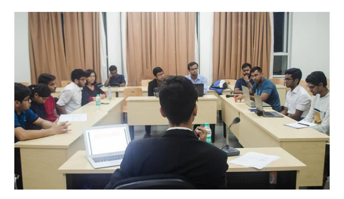
Group Discussion on Data Privacy Bill by Centre for Specialisation in Cyber Law Studies

Centre for Specialisation in Cyber Law Studies conducted Two Day Event "Group Discussion on Data Privacy Bill" during 21<sup>st</sup> & 22<sup>nd</sup> –September-2018. Day one of the programme dealt with the issues regarding the jurisdiction, cross border data transfer and ended with an amicable solution from both the panels and the main issue was sought out very commendably. The Agenda for the second day was Data Principle Rights given in the data privacy bill and recommendations were submitted at the end of the discussion.