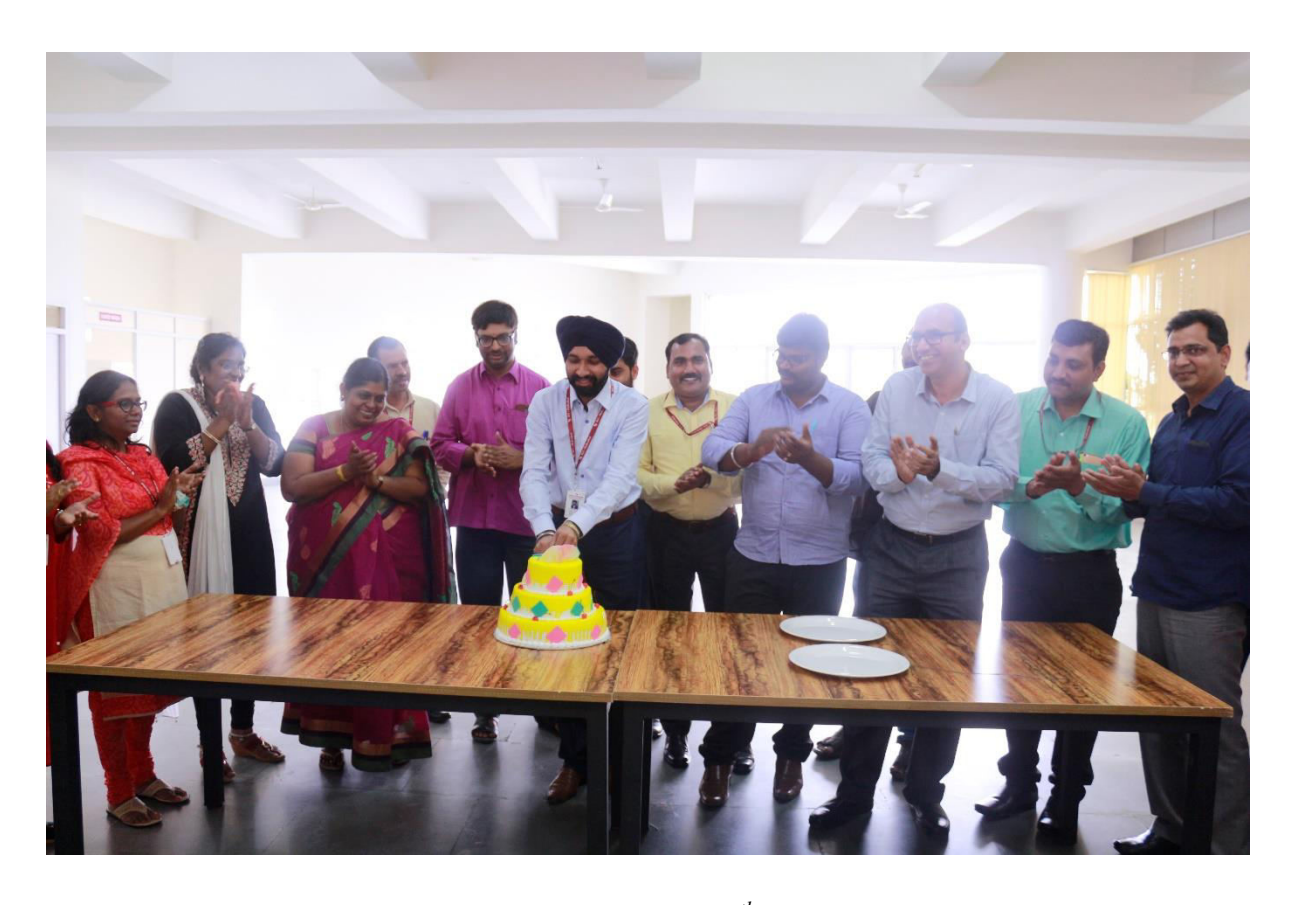
Teacher's Day Celebration on 5<sup>th</sup> September 2018