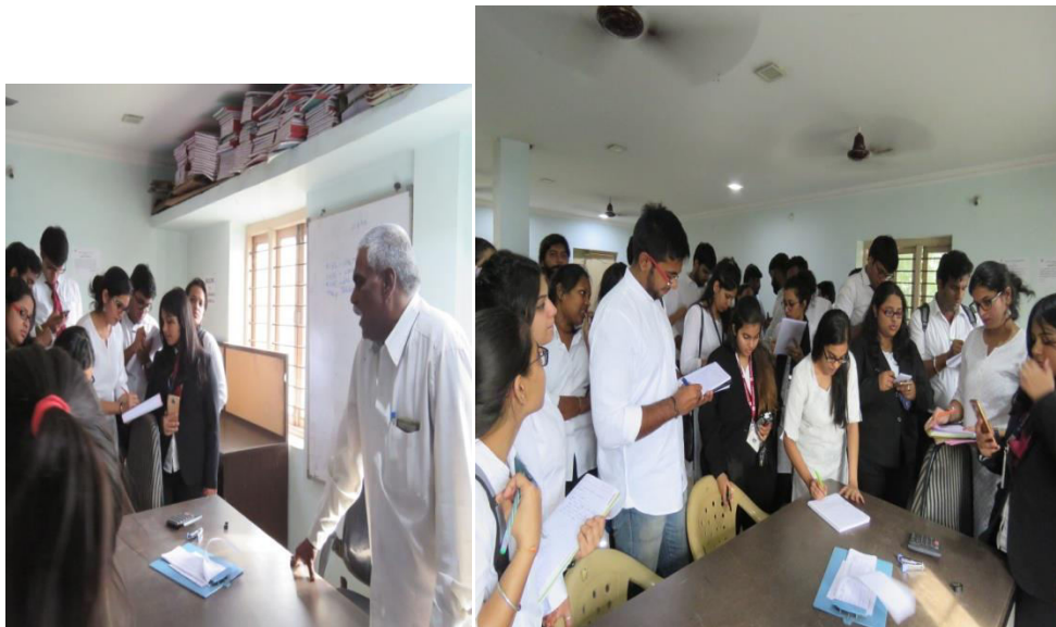
Industrial Visit- Officers addressing to the students