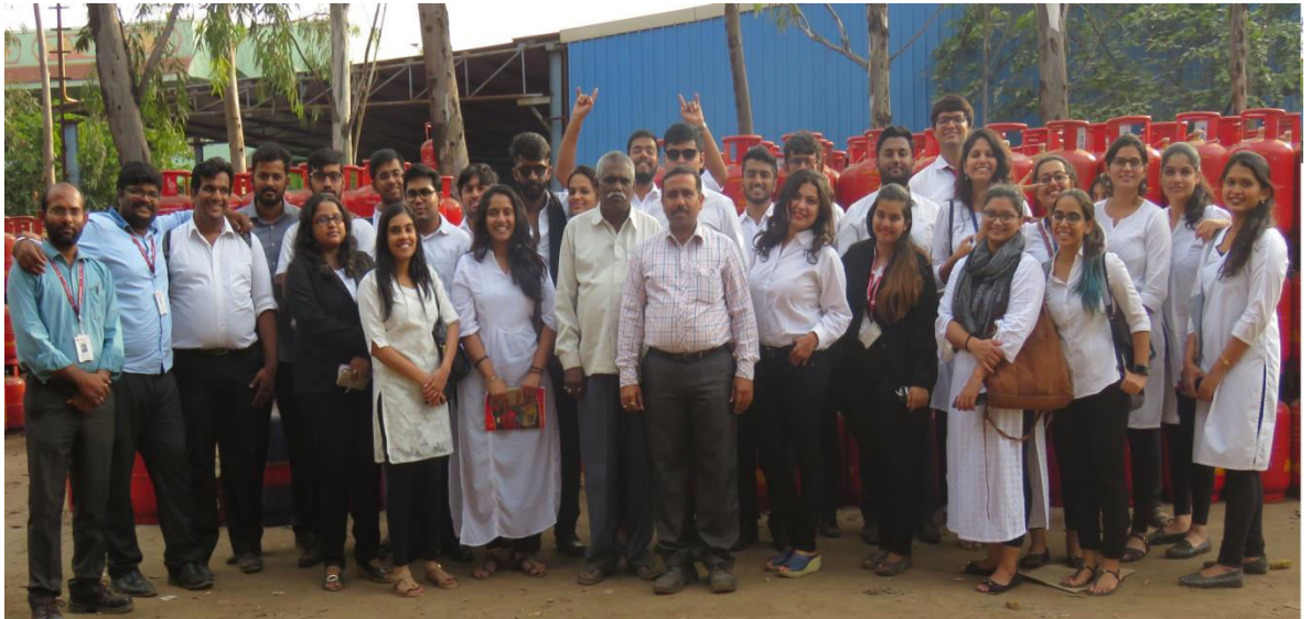
Industrial Visit – Officers, Faculty members with students