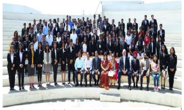
Participants and other organising Team Members along with the Dignitaries at CONVERSE'19