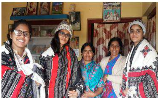
Students interacting with the ladies of Kurumba Tribe