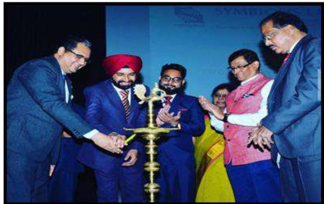
Dignitaries Lighting the Lamp at Inauguration Ceremony of CONVERSE'20