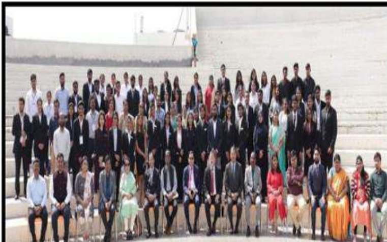
Participants at the National Conference on Uniform Civil Code