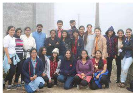
Team CCCJ and Team CHR, SLSH