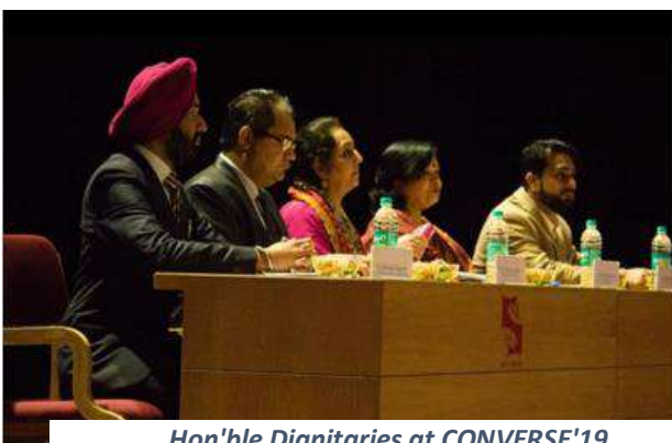
Hon'ble Dignitaries at CONVERSE'19

The conference was based on sub-themes like Women and Personal Law, Women & Cyberspace, Women & Media, Women & Constitution, Women & Criminal Justice System, Women & Trafficking, Women & Empowerment and Women & Reproductive Rights. The Inaugural Ceremony of