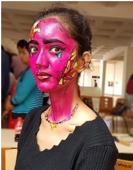
Participants of Face Painting Competition