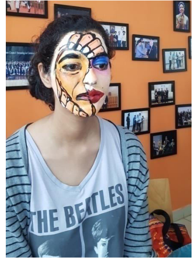
Participants of Face Painting Competition