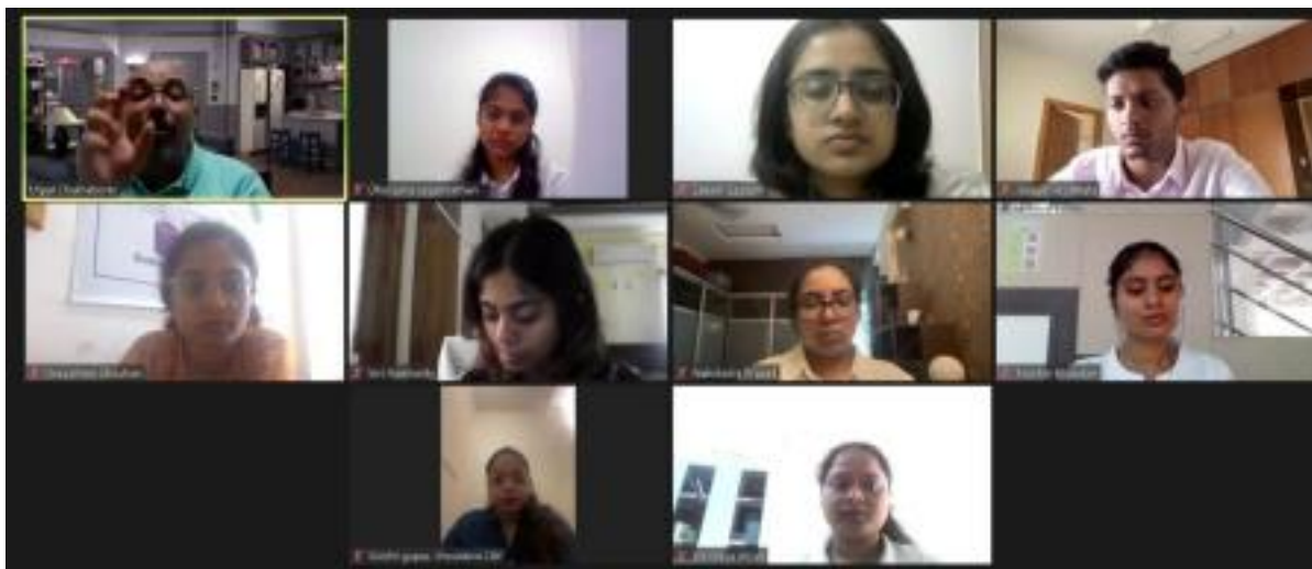
Participants Engaging with the Speaker Through an Interactive Doubt Clarification Session