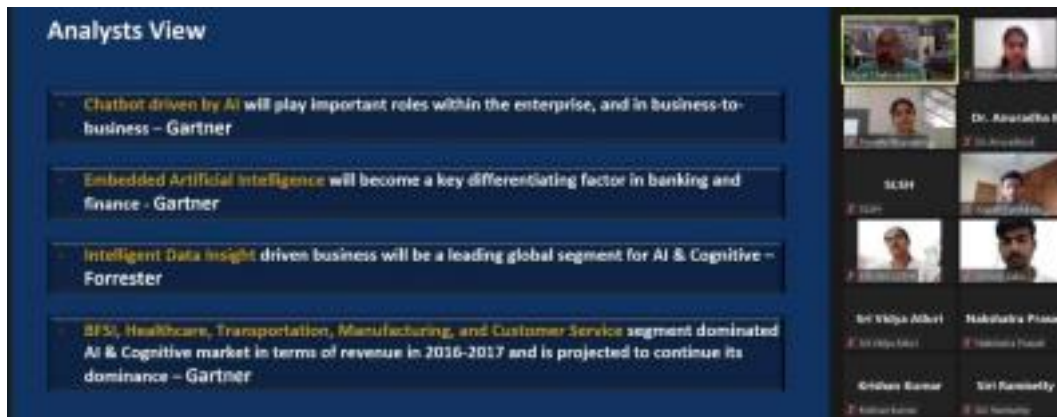
Webinar Taking Place in Full Swing